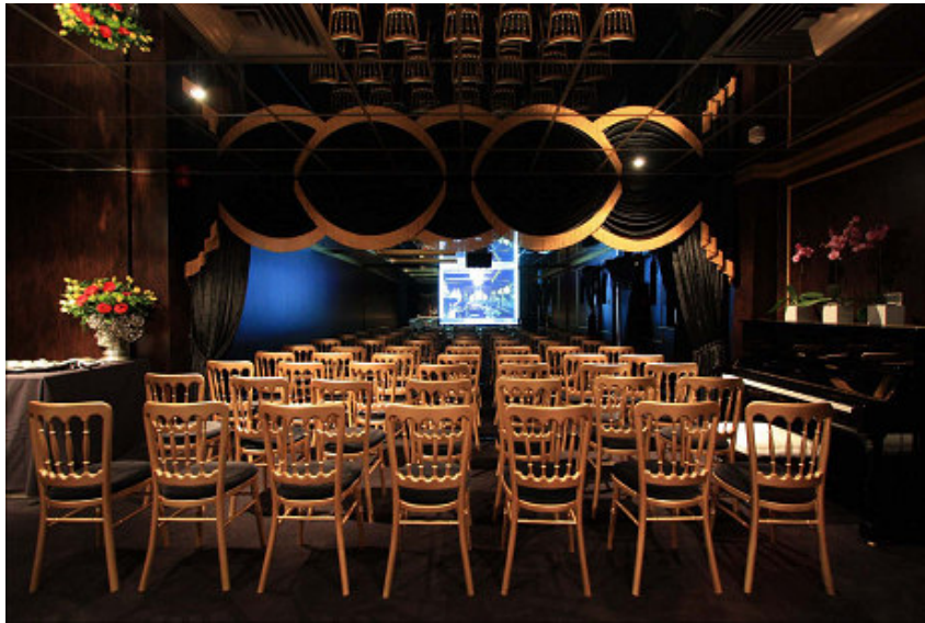
Above: The Boardroom set up in a theatre style setting featuring the 2.4 metre projection screen.

The Millennium Building consists of a large open plan space downstairs (The Boardroom) and three separate syndicate rooms upstairs (The Suites) that can be hired independently, or in conjunction for team breakouts, brainstormers or private meetings. The Boardroom features a 2.4 metre electric projection screen which drops down from its recessed housing in the mirrored ceiling, a Hitachi LCD projector - housed in a motorised projection lift which is mounted in the ceiling void above the mirrored panels, distributed SKY TV, B&W stereo speaker system, iPod docking station, DVD player and 6 PC connection points. All of these devices can be controlled effortlessly by the touch of a button on a wireless touch screen controller.