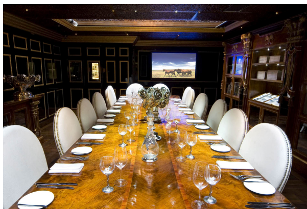
Above: The Library featuring a 65" Panasonic HD plasma screen

The Beaconsfield venue comprises of a bar offering a comprehensive drinks list (including over 150 wines), two restaurants serving modern English and Thai food and ten bedroom suites individually designed using elaborate materials (including copper baths that fill from the ceilings!).