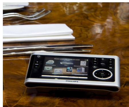
Above: Philips TSU-9600 colour touch screen