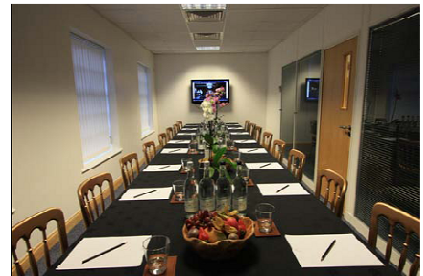
Above: The Suites featuring 42" & 50" LCD HD TV's

Two of The Suites feature 42" LCD HD televisions and two PC connection points, whilst the third Suite features a 50" LCD HD television, six PC connection points and an Aux video connection for games consoles/handycam.